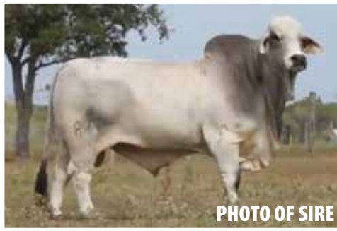
PHOTO OF SIRE