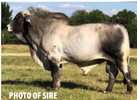
PHOTO OF SIRE