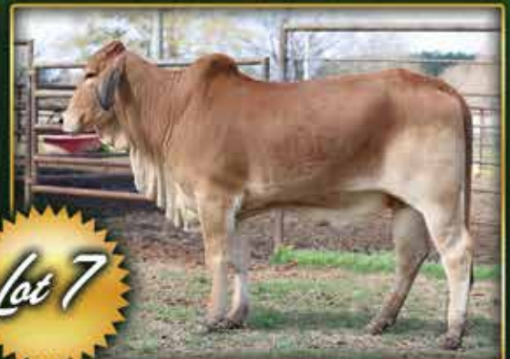
SELLING BRED TO BRUCE