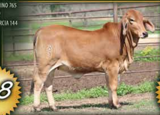
SELLING SIRED BY BRUCE