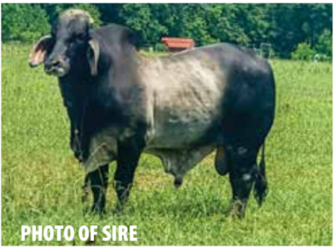
PHOTO OF SIRE